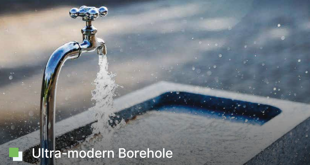
■ Ultra-modern Borehole