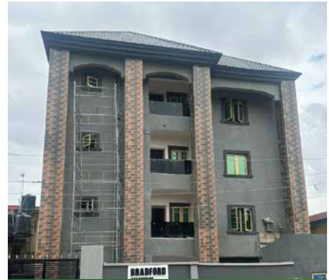
Bradford Apartment / Sold Out