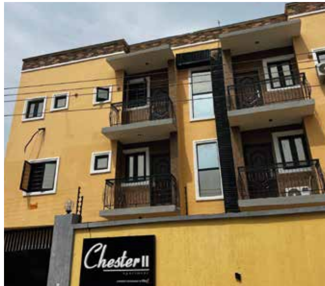
Chester II Apartment / Sold Out