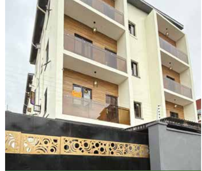
Wells I Apartment / Sold Out