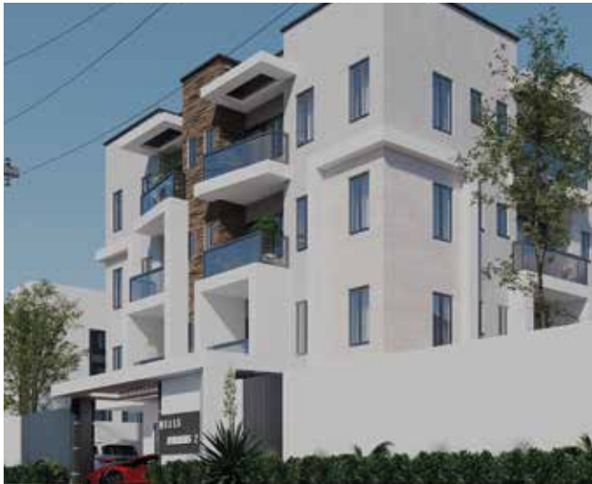
Wells II Apartment / Sold Out