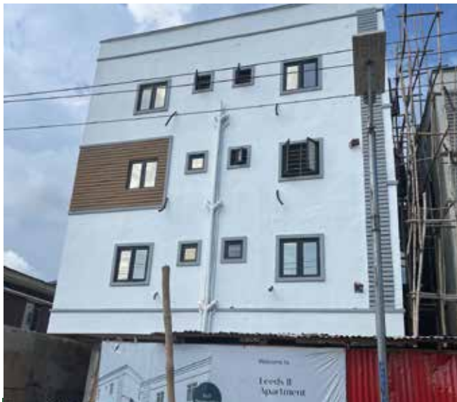
Leeds II Prime Apartment / Sold Out