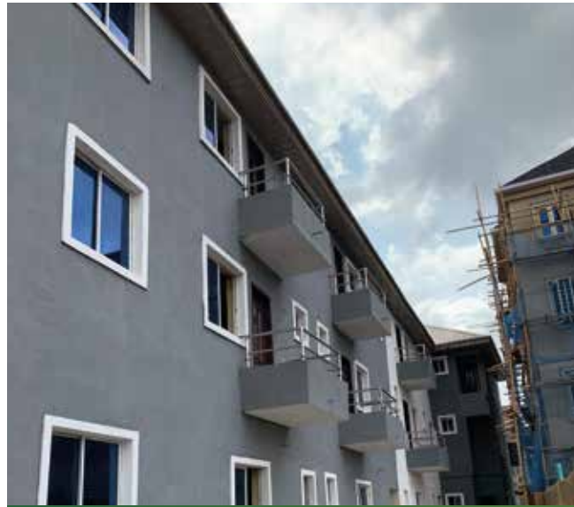
Oxford Apartment / Sold Out