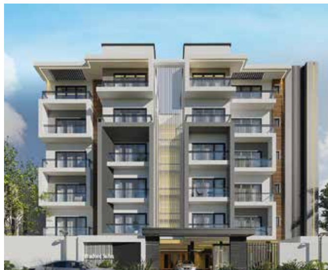
Bradford Suites / Sold Out