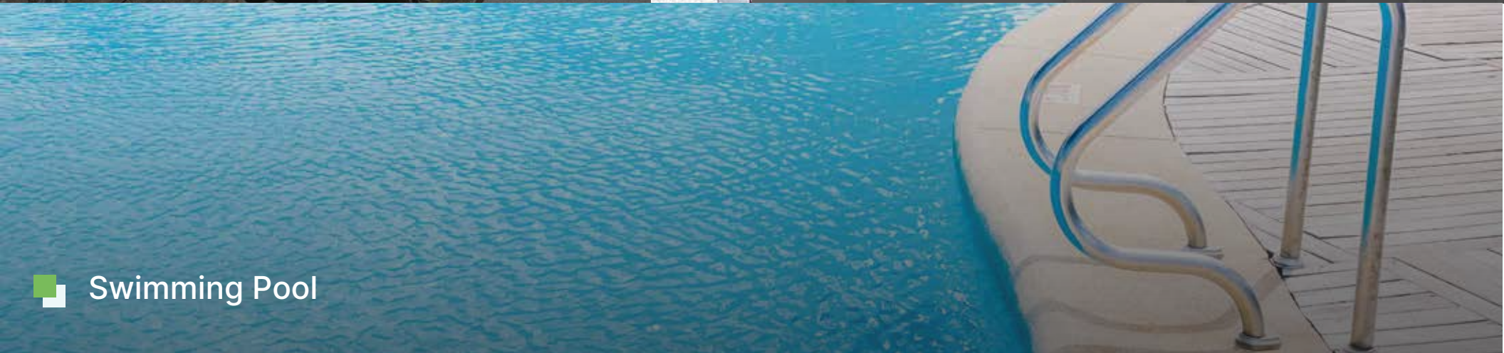
■ Swimming Pool