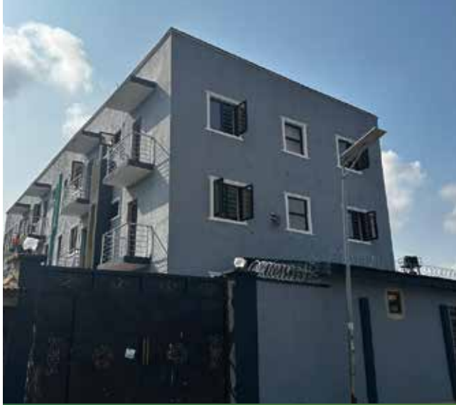
Chester I Apartment / Sold Out