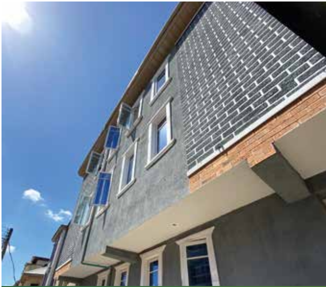
Fortune Apartment / Sold Out