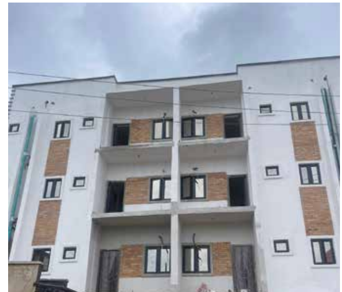
Leeds II Apartment / Sold Out