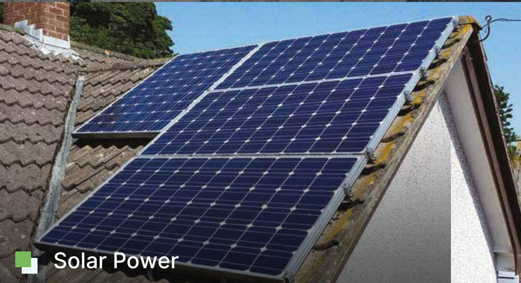
■ Solar Power