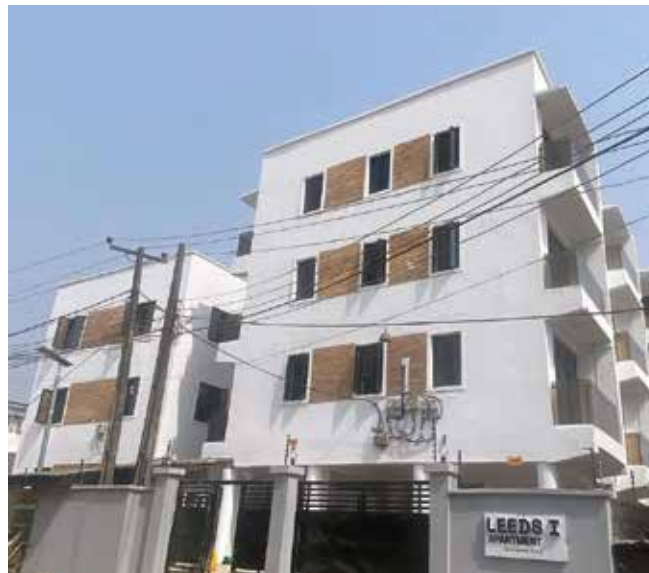
Leeds I Apartment / Sold Out