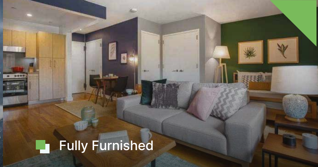
■ Fully Furnished